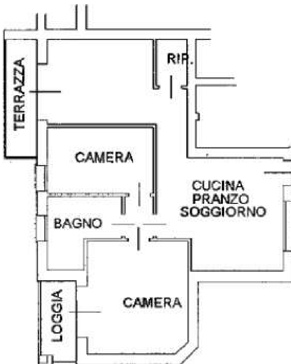
PIANO PRIMO H=270